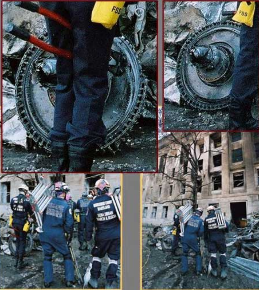
Pentagon Turbofan Composite made from FEMA Photo Archive As highlighted by Eric Hufschmid and Christopher Bollyn (AFP)

Is this really a 757 engine disc, either RB 211 or Honeywell APU? Or is it instead from the engine of a smaller plane or missile?